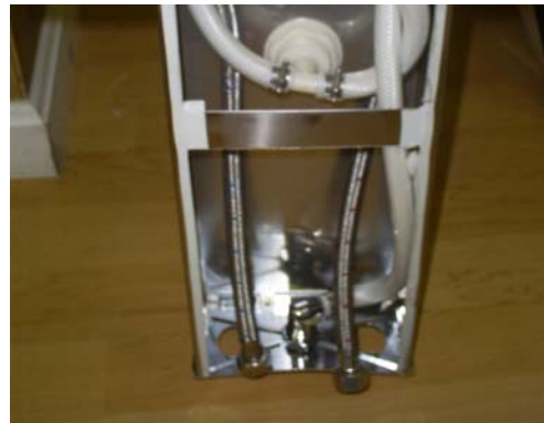
Cold & Hot Pipes

The distance from the top of the shower panel to the floor should be 85 in.