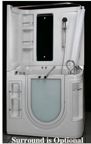
Surround is Optional